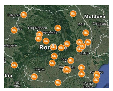
Figure 1 Location of proposed sites

These buildings include emergency response headquarters, fire and rescue stations and command centers. The inoperability of these buildings during an earthquake, storm or flood disaster would create a significant gap in the government's response capacity. They represent a small percentage of the total number of public buildings in Romania that are at risk from collapse or serious damage. However, this Project aims to develop the systems, frameworks and data for an eventual larger scale risk reduction program. It will also showcase the benefit of this approach for short-term gain, such as amenity and energy efficiency improvements, and long-term risk reduction and climate adaptation and will provide a very visible sign of the government commitment to, and progress in, risk reduction. This is particularly important given the limited progress in Romania in risk reduction in recent decades.