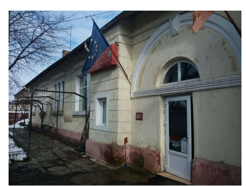
Figure 3. Tecuci Fire Fighting Detachment

According to the law 422/2001, Galati County General Direction of Culture issued the permit no. 1105/16.08.2021 regarding demolition and construction works at Tecuci Firefighters Detachment under the condition of providing archeological surveillance.