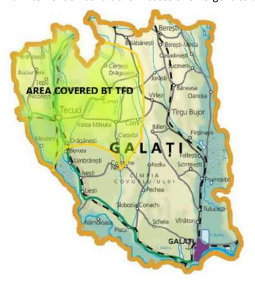
Figure 2. Area covered by Galati County IES and TFD

The Fire-Fighting Department Tecuci was initially created in 1926 and was active until 1968 when it was closed by the authorities. In 1994, the subunit became active again, moving to the building where it operates today, at 27A, December 1st 1918 Street. The building was built before 1889 and is today in an advanced state of degradation, providing poor working standards for the 101 members of staff operating in the building. This detachment covers fire-fighting services and SMURD emergency ambulance services and operate in the field of prevention, preparation and interventions in cases of emergency. Also, the equipment of the unit in underperforming and does not provide optimal intervention conditions in cases of emergencies and extreme events.