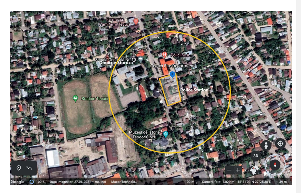
Figure 4. TFD 0 meters radius neighbors

The building - Central Pavilion + Garage - with partial basement and ground floor height, has a "U" shape - with the main wing (west) arranged parallel to December 1st 1918 Street.